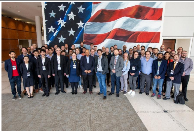
CFD4NRS-9, 21 February 2023, Texas A&M University, TX, USA