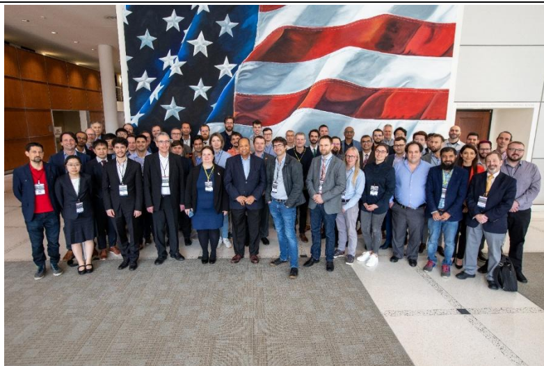
CFD4NRS-9, 21 February 2023, Texas A&M University, TX, USA